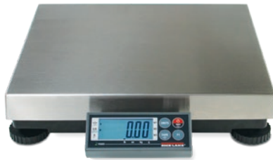
Model BP 1214-S with stainless steel shroud