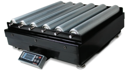
Model BP 2424-S with roller conveyor weight platter